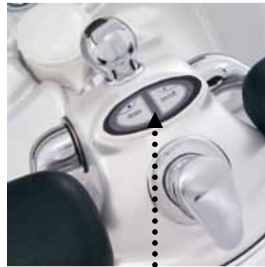
On/Off & Drain Button as with PDP option

Note: Pressing with finger nails, rather than the pads of fingers, can damage the on/off switch and will not be covered under the warranty.