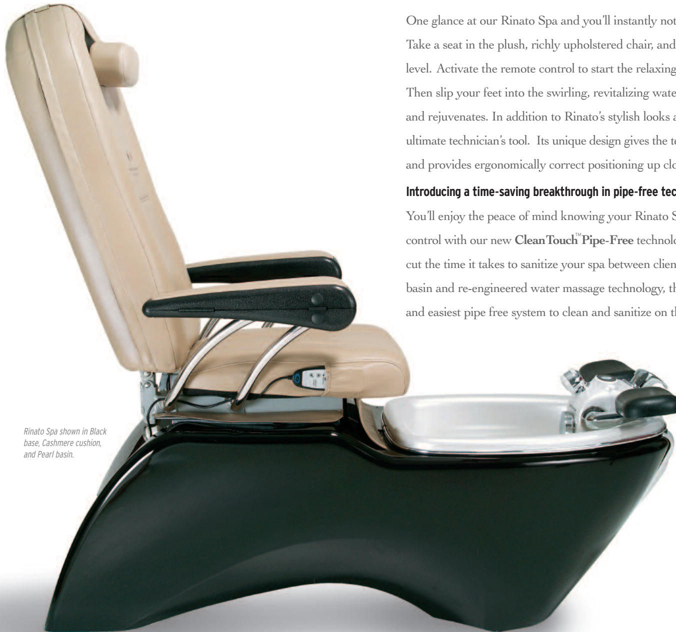
Rinato Spa shown in Black base, Cashmere cushion, and Pearl basin.

Winner - 2006 and 2007 NAI's Magazine Readers Choice Award for Best Pedicure Equipment