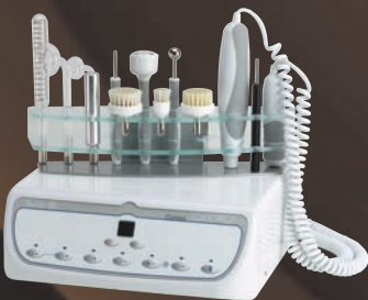
Convenient table top unit